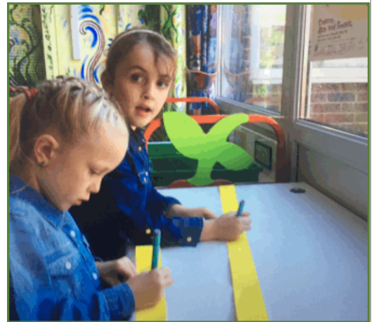
Children writing their story lines for the seven line poems