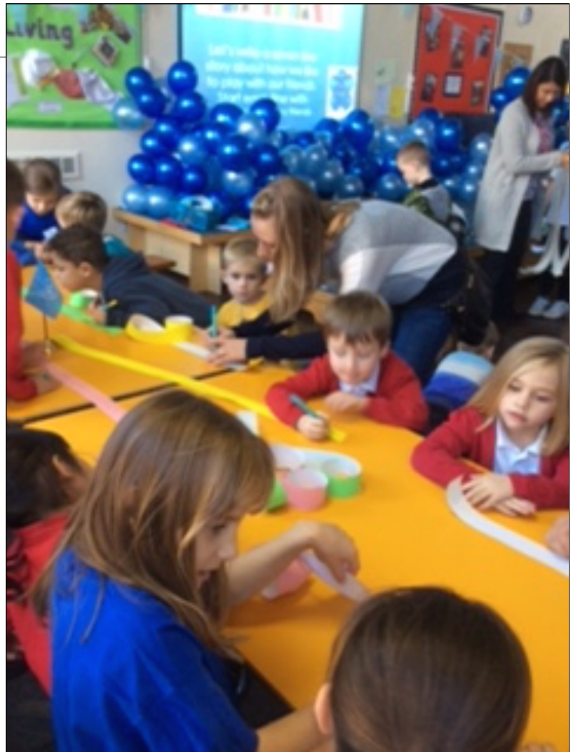
Parents and the Global Club helping KS1 children with their seven line stories

The Sneetches clip showed how to play and make friends with everyone