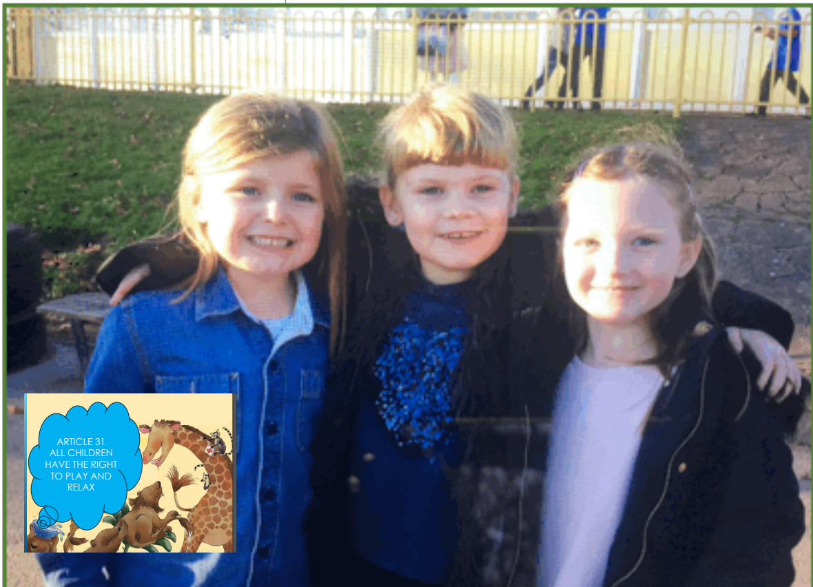
Children relaxing and playing with new friends